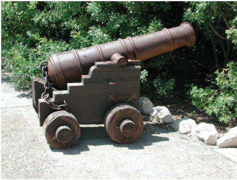
Ref. CAÑON - P ( Base no incluida )