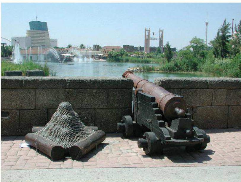
Ref. CAÑON - G ( Base no incluida )